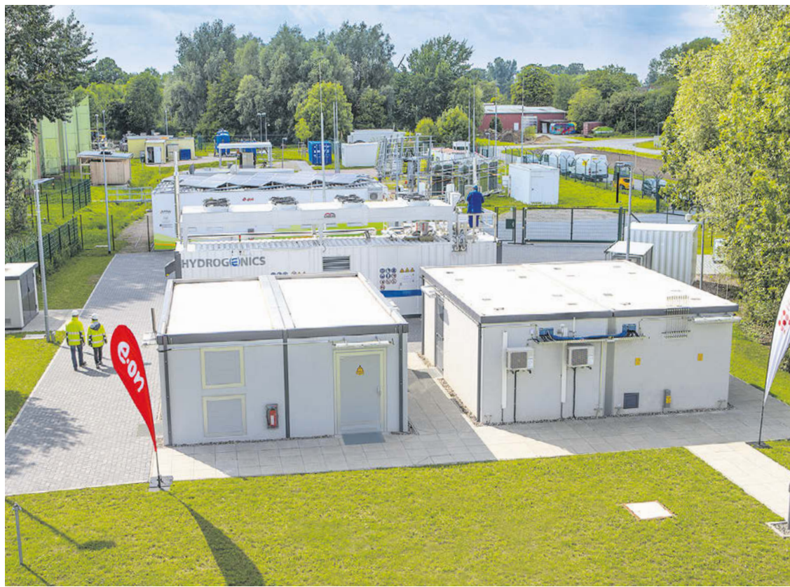
Canadian clean technologies are finding recognition in the global arena, for example Hydrogenics, a company that provides energy storage solutions in Germany. But experts say the industry needs better support to realize its full potential.

Source: Analytica Advisors and Canadian Renewable Fuels Association